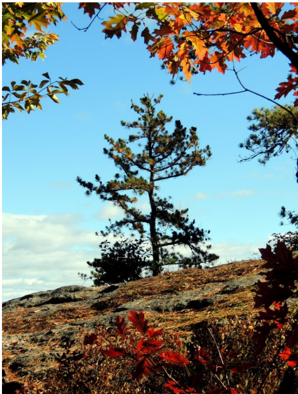
Pitch Pine above Stonehouse Pond